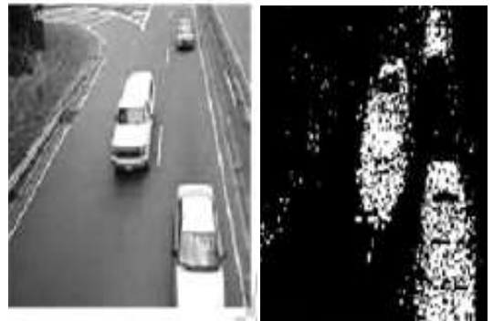
Original frame subtraction frame Fig.2. Detection of moving objects using Background subtraction method